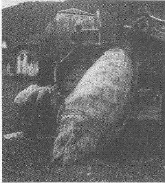
Fig. 1 - Stranded specimen of Ziphius cavirostris . Right side view from front.